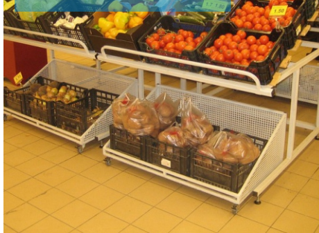
Trading stands Latvia TOP chain store