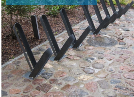
Bicycle stand Latvia