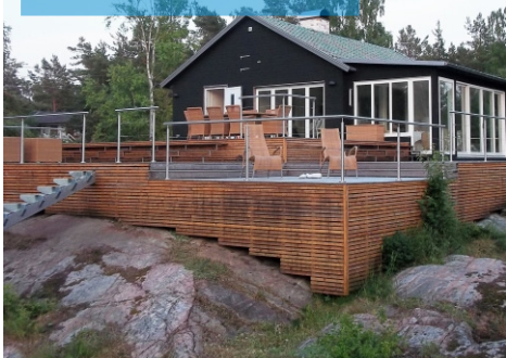
Stainless steel railings and stairs Sweden, Gräsö