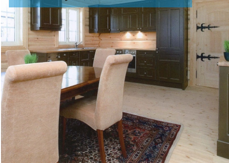
Door hinges and interior elements Norway, AD arhitekter AS