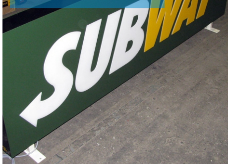
Advertising signs Sweden