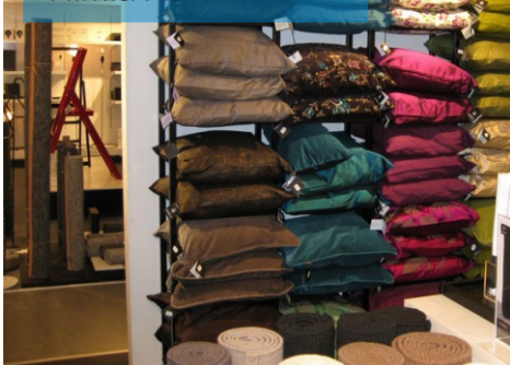
Trading stands Sweden, Stockholm Himla AB