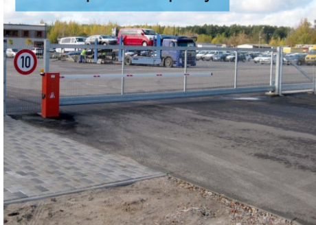
Sliding gates Latvia, Riga Transport company