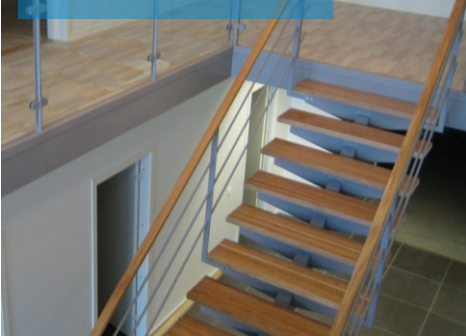
Railings and stairs Sweden, Uppsala Himla AB