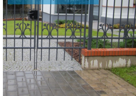
Fences and gates Latvia, Cēsis The library building