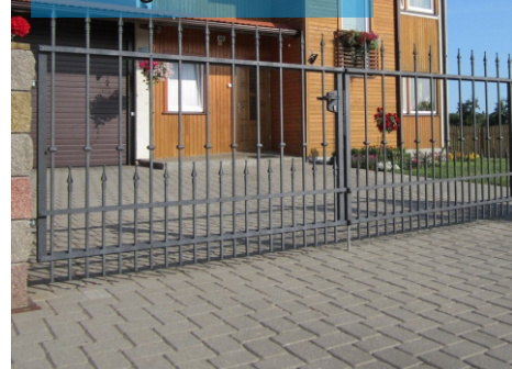
Forged gates Latvia, Koceni Cottage